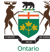
Doug Ford Premier

Best wishes for a memorable and inspiring event!